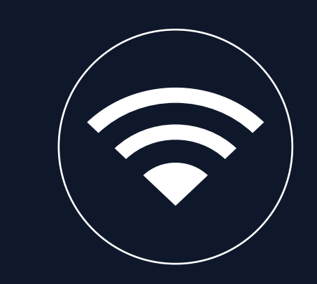
Dual frequency WiFi