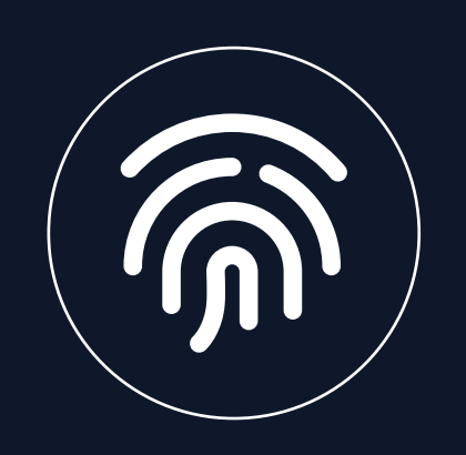
Press-type fingerprint recognition