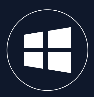
Windows 11 Pro Operating System